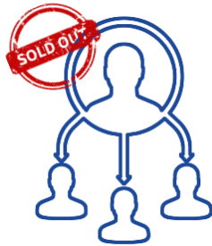
Delegate Kit Sponsorship